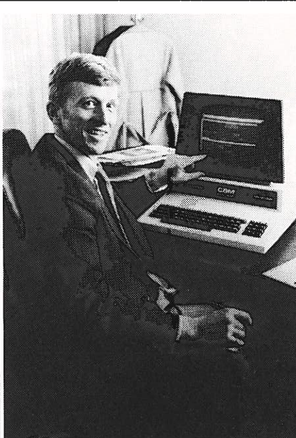
Don Whitewood, B.A. Sc. CBM™ Model 8032 computer

Filing and storage present no problems. With a disk drive, the operations performed in calculations, charts, graphs, curves, etc. can be easily stored on standard 5¼ inch floppy diskettes in an organized, retrievable