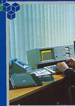
Dial telephone numbers, or 'log on' to data services...AT THE TOUCH OF A BUTTON