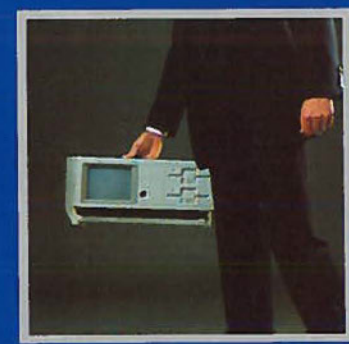
Move it around the office or take it around the world in its handsome protective travelling case

Hyperion's IN:SCRIBE (tm) redefines micro-computer text editing. This is not a complex word processing program, but a productive tool for the busy professional. Reports and memos can be quickly entered and modified, using a menu-like set of function keys. For example, entire portions of text can be quickly moved to different parts of a document.