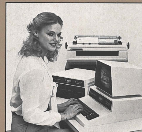
Typical hardware configuration.

Commodore CBM 8032 Computer with 80 column display. Commodore CBM 2040/4040/8050 Dual Drive Floppy Disks. Commodore CBM 2022/2023 or other properly interfaced ASCII printer such as the NEC Spinwriter or Diablo 630.